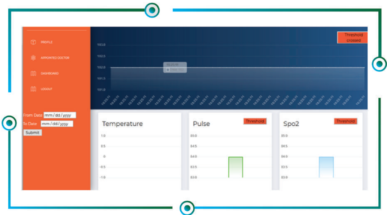
Figure 3 Dashboard